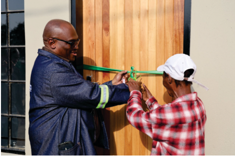
The joy of becoming a home owner Page 3