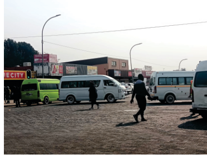
Taxi mayhem in the city glory Page 3