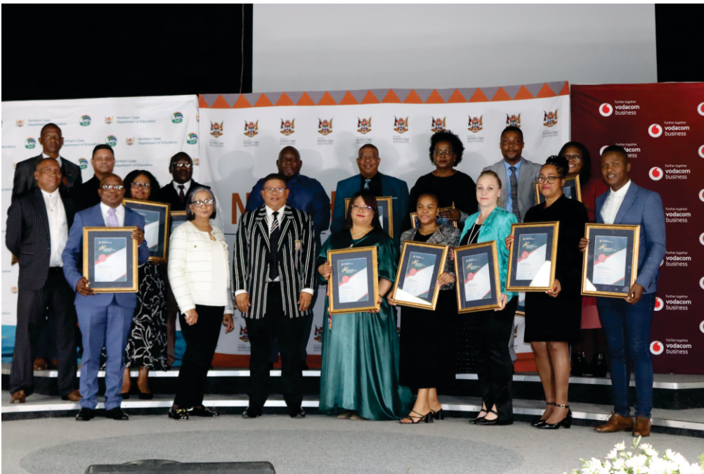
Acknowledging hard work