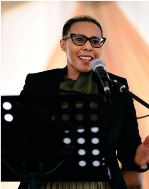
MEC Mase Manopole addressing Farmers