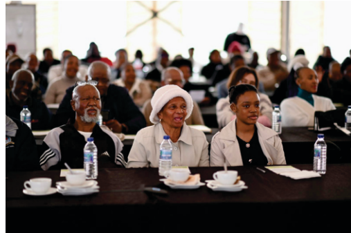
Blended finance for Farmers Page 3