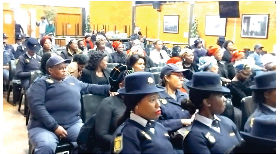
Law enforcement agencies