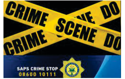
Crime does not pay Page 7